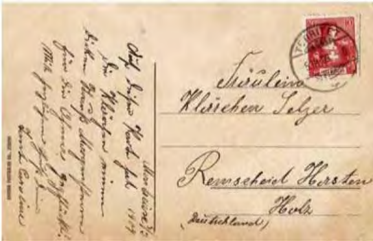
Hartmann' s divided back design on rear side of Postcards

was for the address and pre-printed postal rate. Later, small adverts and illustrations were approved on the front of postcards and by 1899 several countries were producing illustrated cards. Then in 1902, a German firm Hartmann's, introduced the "divided back" postcard we are all familiar with today, where the message and address could both be written on the same side (back), leaving the other side (front) of the card available for full illustration and printed pictures.