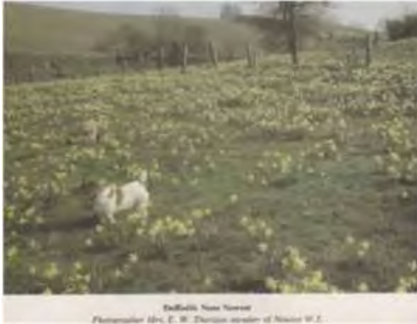
Postcard by the Gloucestershire Women's Institute showing - Daffodils Near Newent