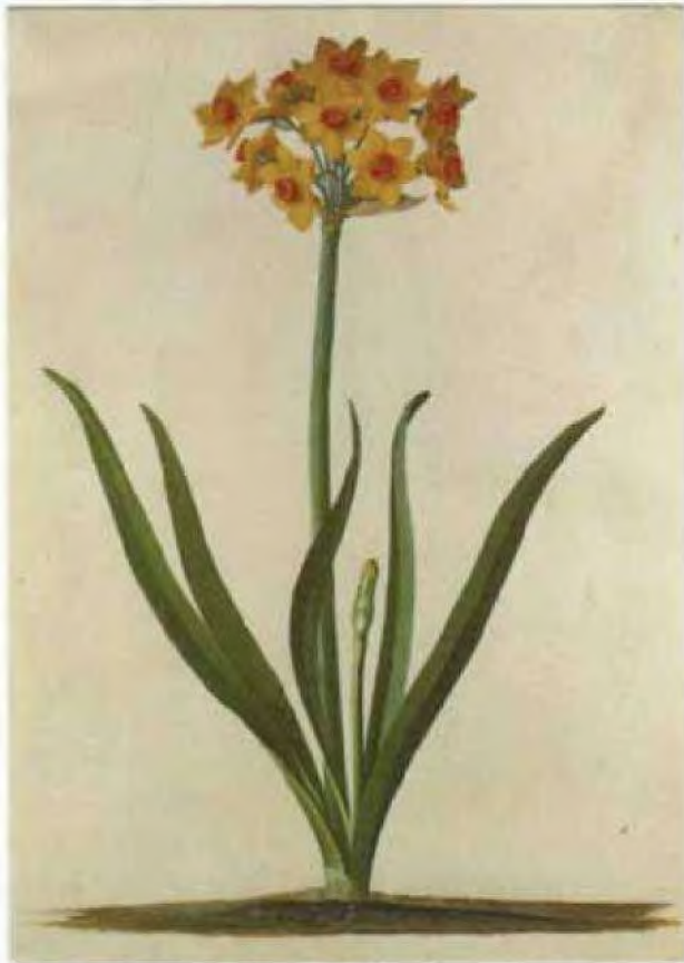
Modern postcard issued by the Victoria & Albert Museum

As you can see from the prints included in this article, they demonstrate the wide range of postcards produced from the 1890' s to the present day. I hope you enjoy them as much as we do and would love to hear from anyone who is interested in this area of “ daffodilia” or requires more information.