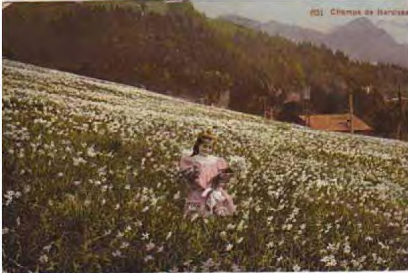
Champs de Narcisses an early card

from portrait pictures of individual cultivars, to pictures of mass plantings, right through to modern artistic impressions of daffodils. Equally, there are many beautiful cards showing "real photo" images of subjects like daffodils harvesting on the Isles of Scilly, Wordsworth's daffodils by Ullswater in the Lake District, Yorkshire's famous wild daffodils in Farndale on the North York Moors. Daffodils growing in Lincolnshire, Spalding Horticultural Society Gardens and Flower Parade plus cards of many other locations throughout the world where daffodils can be seen.