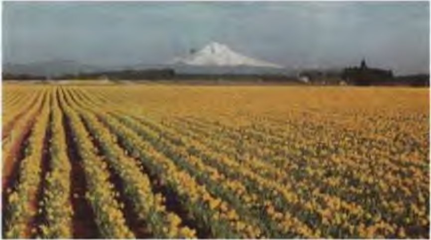
The vast Daffodil and Tulip fields in Western Oregon. From the Union Oil Company ' Natural Colour Scenes of the West'

America is also a good collecting area as many of their greetings/holiday cards are heavily embossed, making the daffodil designs stand out in relief. As with the UK, America also has bulb-growing areas where commercial production of daffodil flowers and bulbs is carried out for the home market. Here, the Puyallup Valley in Pierce County, Washington State is the Lincolnshire of America. Under the shadow of Mount Rainier vast fields of daffodils are grown in the fertile soil of the glacial valley.