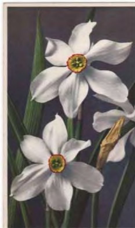
Swiss card by Gyger & Klopfenstein. The Mountain Flower Series - Circa 1940' s

As photography and printing techniques gradually became more advanced, then 'real photo' cards became more colourful and reflected a wider range of subjects. It is in this field of 'modern' postcards that one range of cards has been introduced that depicts rural or 'pastoral' scenes but I will expand on that later.